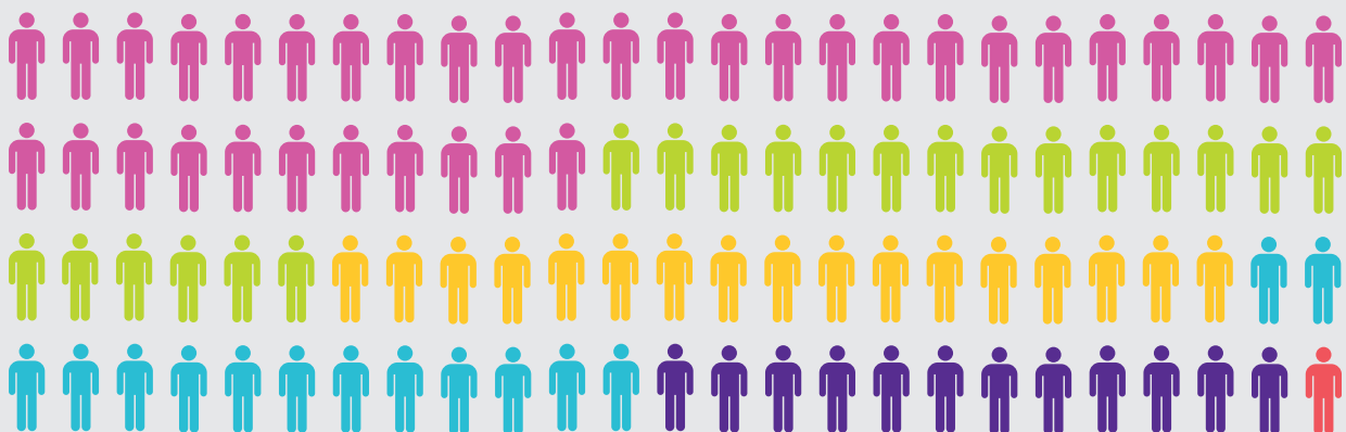
PERCENTAGE OF STAFF WITHIN THE STAFF GROUP